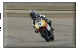
In the curves

The Road Captain will signal for turns or lane changes. Pass the signals on using turn and hand signals.