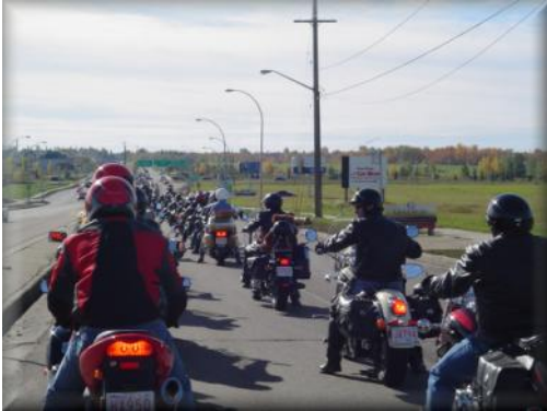
More care required on charity ride.

to do so creates extra risk for everyone in the group including you.