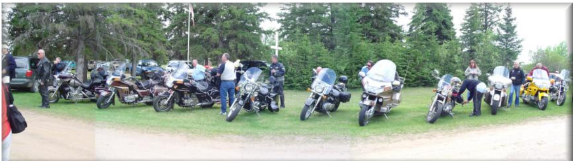
Group Ride to Venice

or chasing the group, will brief and di-