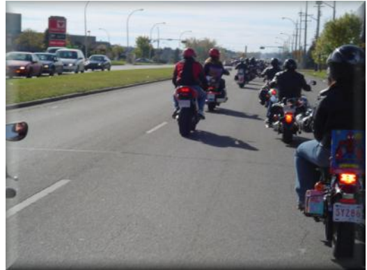
Large Group Ride

rect the ride. All riders will follow the instructions of the Lead in all situations, unless, to do so, would place the rider or any other individual in an unsafe situation.