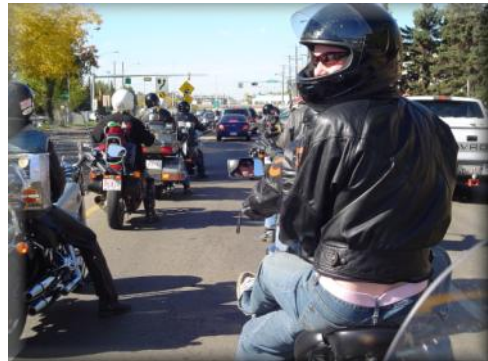
Edmonton Toy Run

You must become one of the group and move in concert with the group. Failing